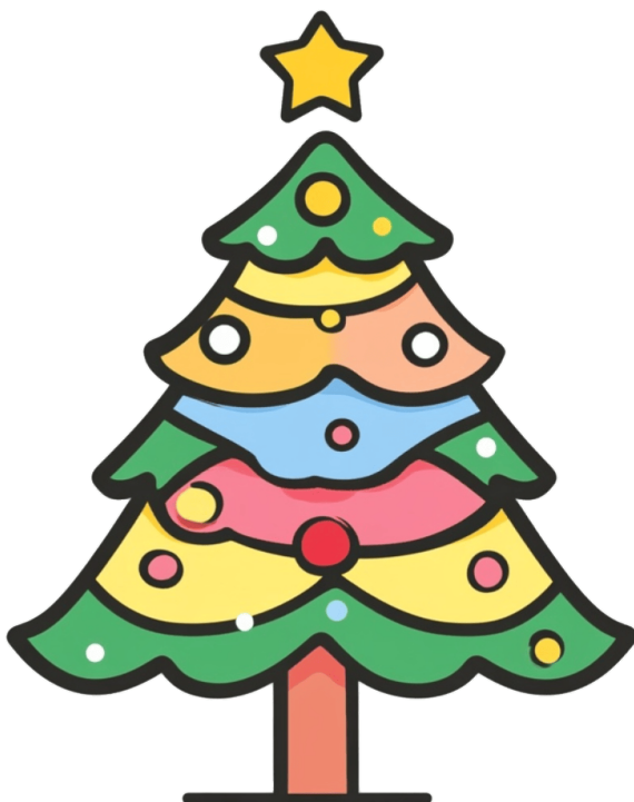
Candy Cane Christmas Tree